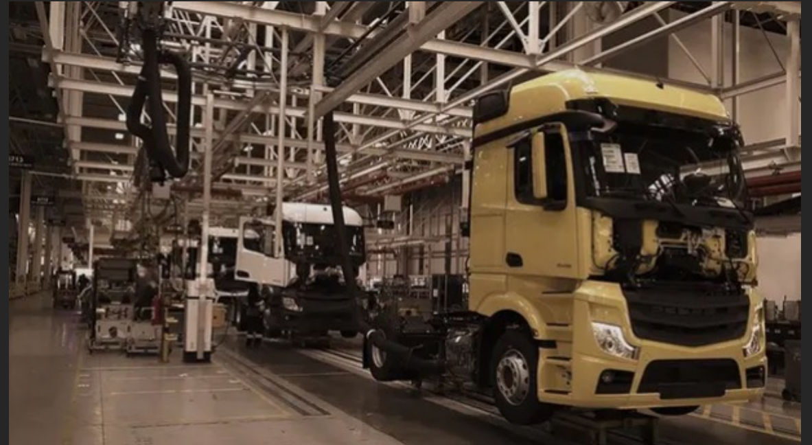
Mercedes Benz Türk Factories, Hadımköy and Aksaray