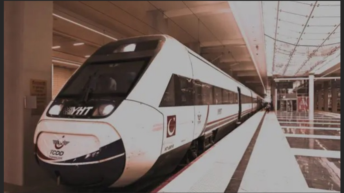
Reventa Engineering, Halkalı Station Gantry Project