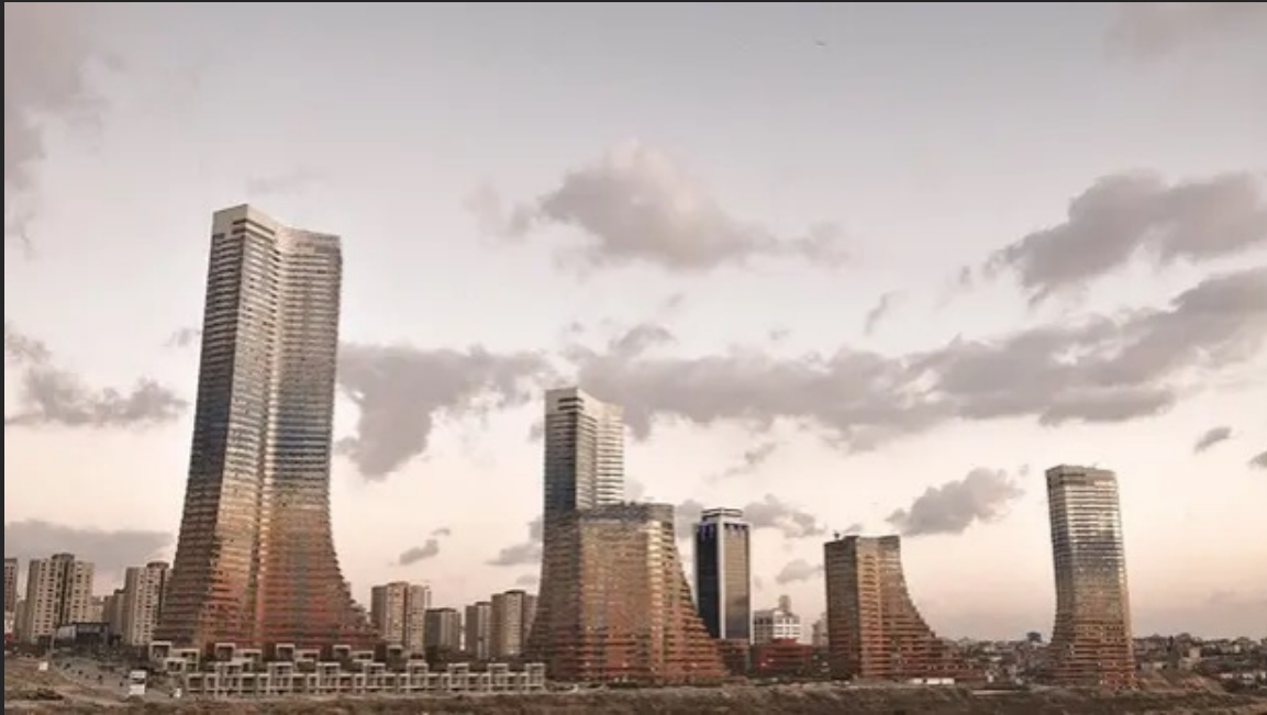
Varyap Meridian, Istanbul