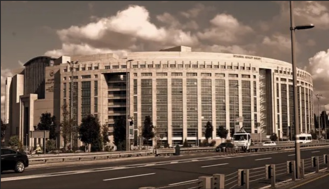
VARYAP Caglayan Palace of Justice, Istanbul