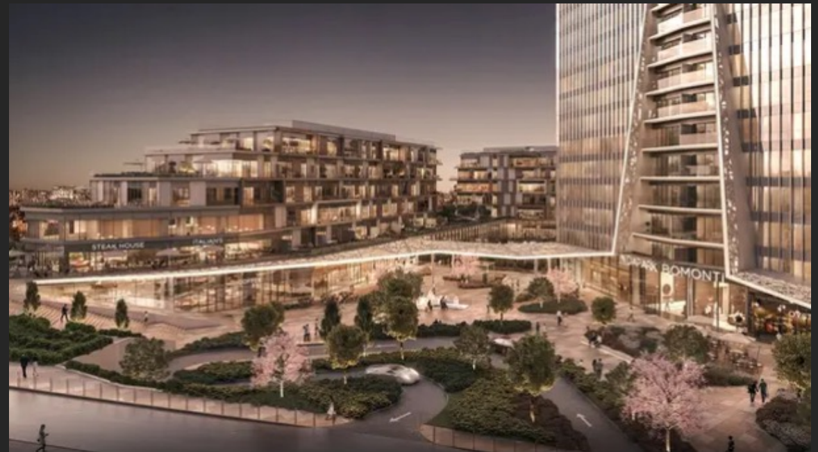
Nidapark Bomonti, Istanbul