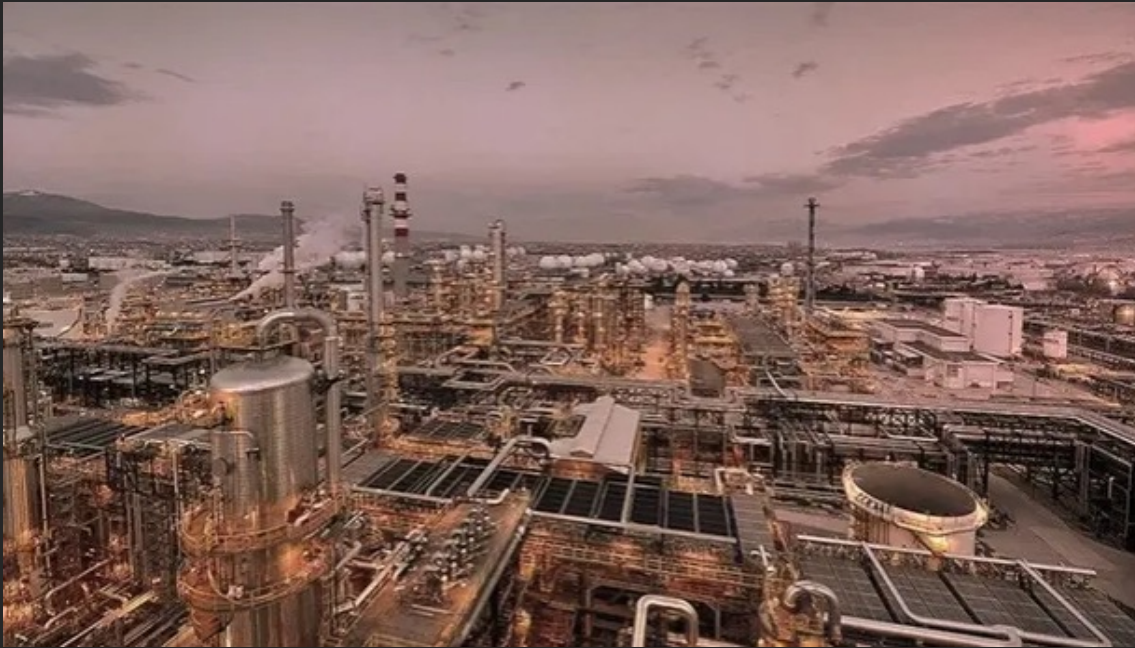
TUPRAS Misc. Tanks, İzmit